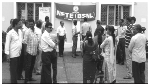
A & N