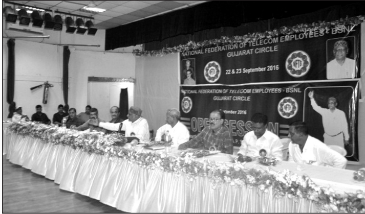
View of Dias

4th Circle Conference of Gujarat was conducted at Silvassa. Which is situated under Daman of union territory of India. The Conference